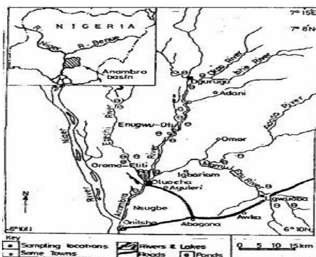
Figure 1. Map of Anambra river basin showing various locations [31]

There are two primary seasons: the rainy season (April - September/October) and the dry season (October/November to March), which roughly correspond to the dry and flood phases of the hydrological regime, respectively. The Anambra River Basin Development Authority was one of the 12 river basins established in 1976 by Decree No. 25 of the Military Government of President Olusegun Obasanjo under the Federal Ministry of Agriculture and Water Resources, according to the Federal Military Government (1976) and the Federal Ministry of water resources (2010). Based on the amended Decree No. 35 of 1987, the Authority's mandate was to develop the water resource potential of its catchments. However, it was discovered that the majority of those in charge at the time the basin authority was established lacked official training or genuine expertise in watershed management.